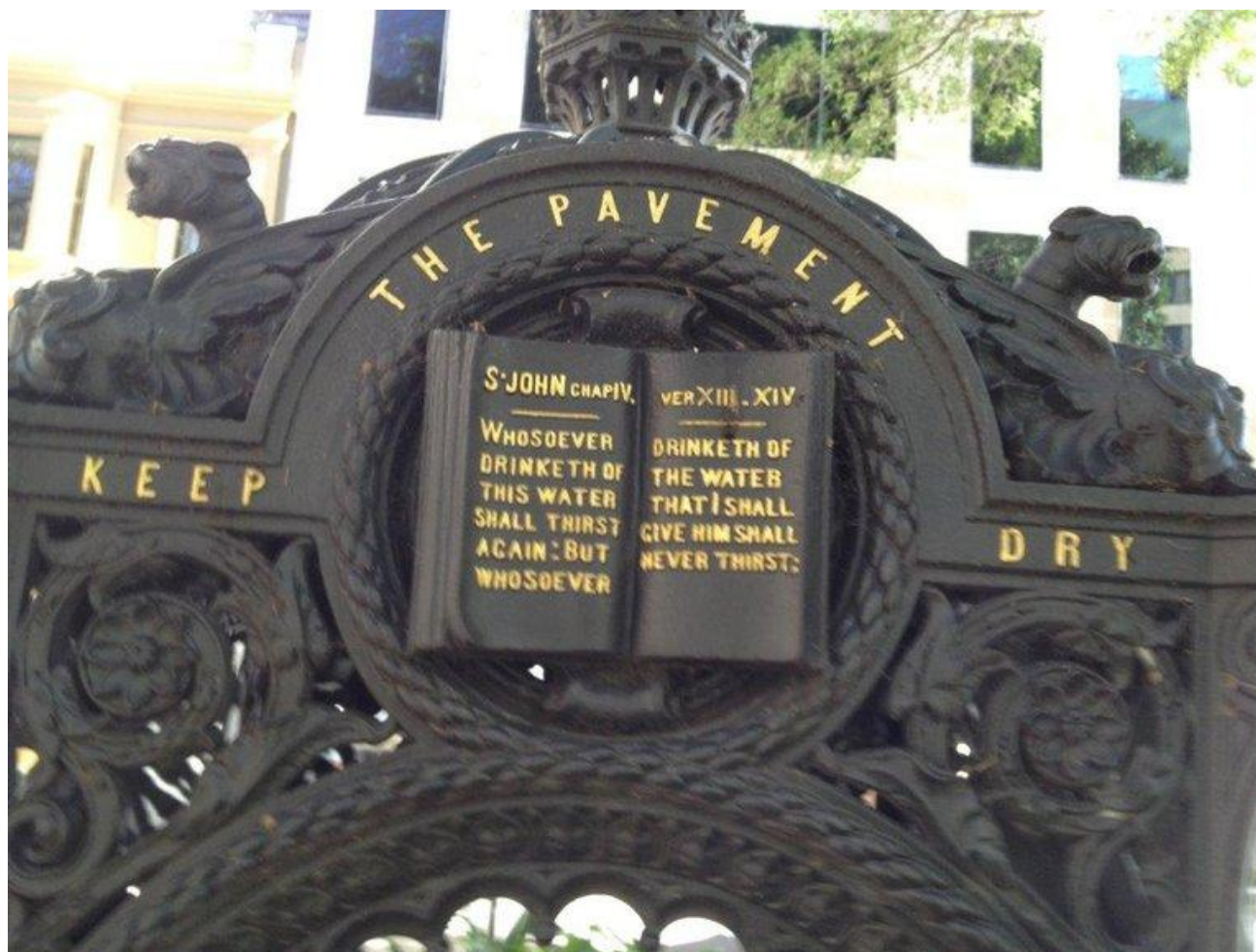
Above. Scripture highlighted on fountain in Macquarie Place cnr Bridge and Loftus Streets near Circular Quay Read more of the Sydney fountains.