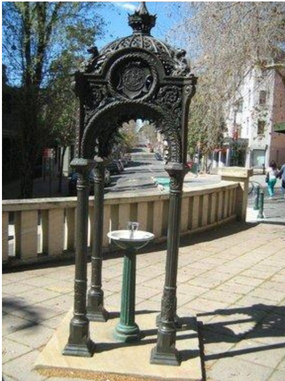
Above. Fountain cnr of Oxford and Riley Streets Sydney

"Whosoever drinketh of this water shall thirst again; But whosoever drinketh of the water that I shall give him shall never thirst."