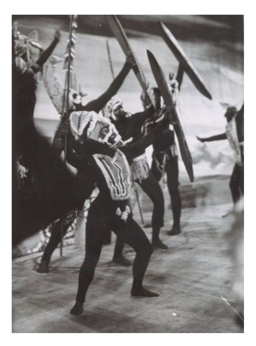
A ballet performance based on the Corroboree

How much has the traditional <u>Corroboree</u> influenced performing arts in the love for story telling, dance and live performances?