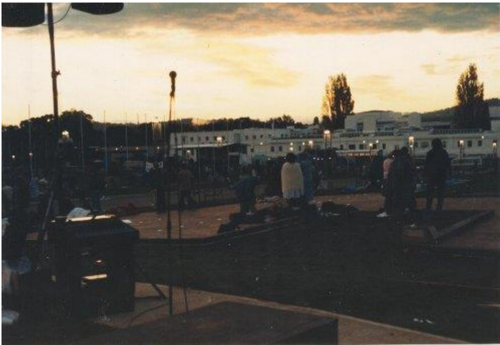
A New Day Dawns

Looking towards Old Parliament House from the Western Prayer Podium, at the conclusion of ten hours of continual prayer through the night for the Nation.