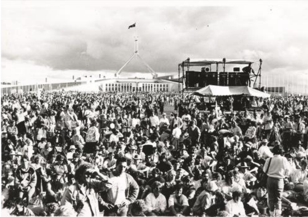
The National Gathering