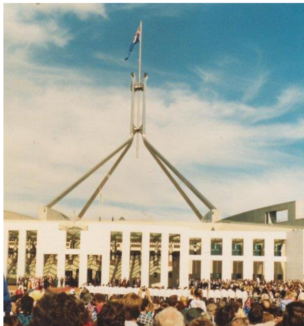
New Parliament House finally opened with prayer. "Jesus is the Light of the world", declares Rt. Rev. Owen Darling, Bishop of Canberra-Goulburn. At the base of the flag support, second from right, is the highest room in the building, set aside for prayer, known as the "upper room".