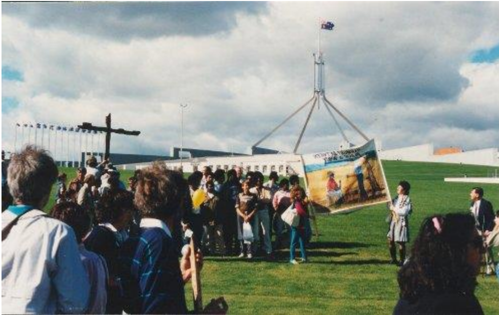
Reconciliation celebrated with the Aboriginal Christian community. The cross made from the sliprails of Myall Creek stands above the crowd at the National Gathering in 1988.